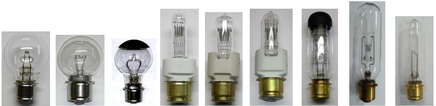
Figure 1 Figure 2 Figure 3 Figure 4 Figure 5 Figure 6 Figure 7 Figure 8 Figure 9