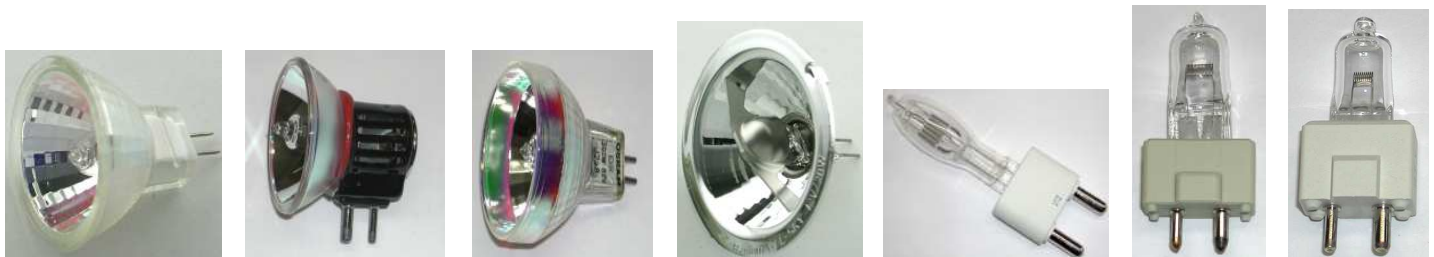
Figure 17 Figure 18 Figure 19 Figure 20 Figure 21 Figure 22 Figure 23