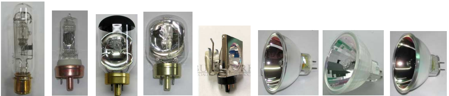
Figure 10 Figure 11 Figure 12 Figure 13 Figure 13A Figure 14 Figure 15 Figure 16