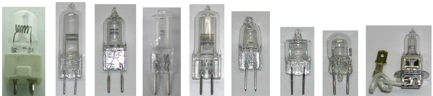
Figure 24 Figure 25 Figure 26 Figure 27 Figure 28 Figure 29 Figure 30 Figure 31 Figure 32

Pictures Are For Reference Only And Are Not To Scale Figure Numbers Correspond To The Bulbworks Cross Reference Guide For Lamps For Optical Comparators & Precision Inspection Equipment Bulbworks, Inc. • P.O. Box 586 • Succasunna, NJ 07876 CALL: 800-334-BULB (2852) • 973-584-7171 FAX: 800-335-2858 • 973-584-0300 E-mail: bulbwork@bulbworks.com Order Online: www.bulbworks.com