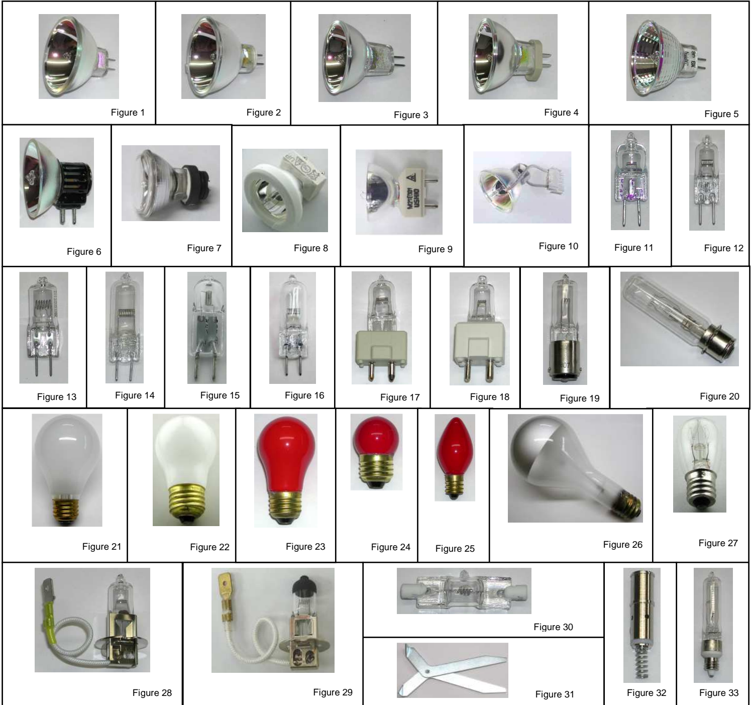
Figure Numbers Correspond To The Bulbworks Cross Reference Guide And Price Sheet For Dental Equipment July, 2016 No Part Of This Catalog/Price Sheet May Be Reproduced Without Permission Bulbworks, Inc. CALL: 800-334-2852 (973-584-7171) • FAX: 800-335-2858 (973-584-0300) E-mail: bulbwork@bulbworks.com • Order Online: www.bulbworks.com

Pictures Are For Reference Only And Are Not To Scale