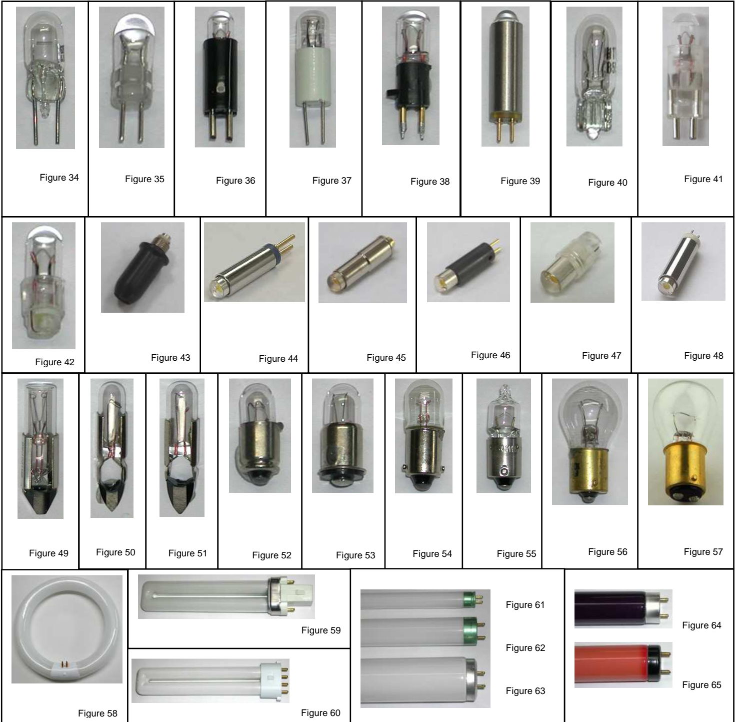
Figure Numbers Correspond To The Bulbworks Cross Reference Guide And Price Sheet For Dental Equipment July, 2016

No Part Of This Catalog/Price Sheet May Be Reproduced Without Permission